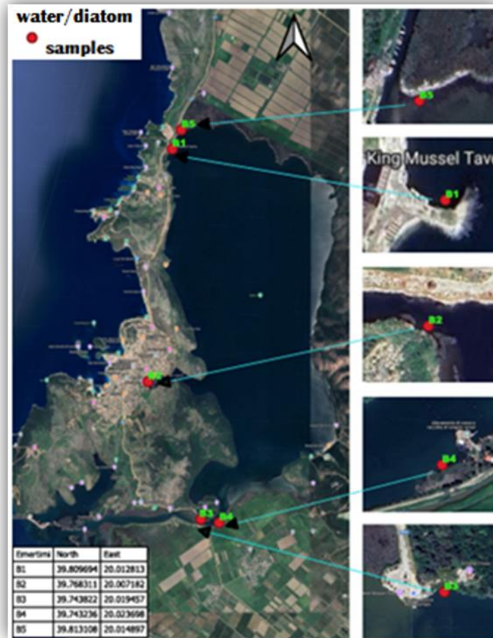
Figure 1. Waters and diatoms sampling points at Butrinti lagoon